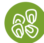
HYBRID CORN SEED